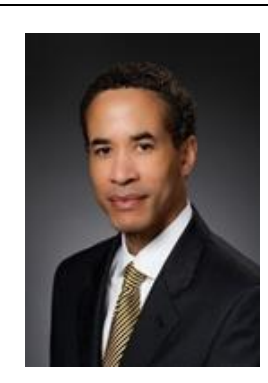
Age : 59

Director Since: January 2006 (and Former Viacom beginning in 2004)